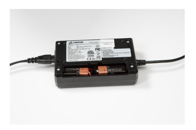
3. Place the batteries and wiring inside the battery compartment of the power supply.

2. Pull out the two battery connectors from the compartment in the power supply and push a 9V battery on to each of the connectors.