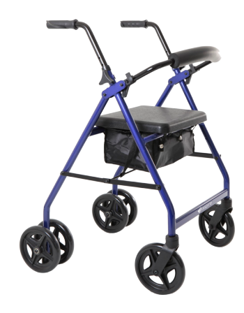
SEAT WALKER PUSH DOWN