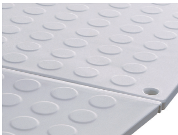
Can also be used without cover.