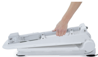
Can be disassembled into 2 parts.